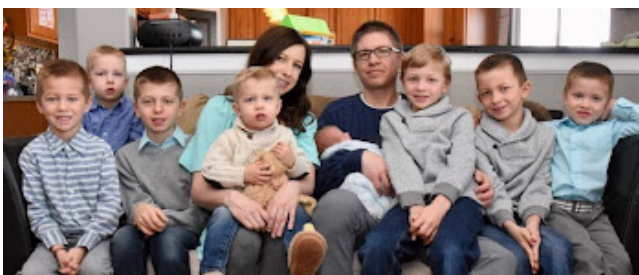
The Cerone Family